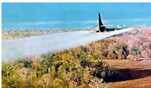
airplane sprays herbicides

Please see the website at https://www.publichealth.va.gov/exposures/infectious-diseases/cholangiocarcinoma.asp for more information.