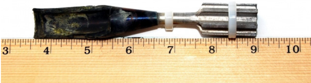
M101 spotting round showing depleted uranium in black.

For those who may have been exposed to CWA during current operations, including Operation Enduring Freedom (OEF), Iraqi Freedom (OIF), and New Dawn (OND), DoD has investigated any possible CWA contacts and identified 411 Servicemembers who may have been exposed.