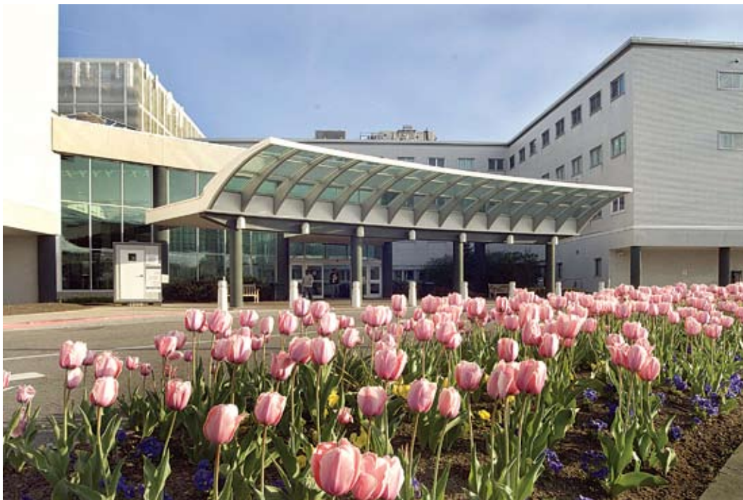
Washington, DC VA Medical Center

into practice. Nevertheless, we need to realize that there is significant benefit for the Veterans by routinely testing for HIV. At VAMC-DC, we have faced the challenge and seen the benefit. We have already observed a 37% increase in HIV testing after VHA policy changed in August 2009. 12 The time has come for VHA providers to screen Veterans for HIV and provide life-saving treatment to those diagnosed with HIV, so that our patients can be guaranteed "the best care – anywhere".