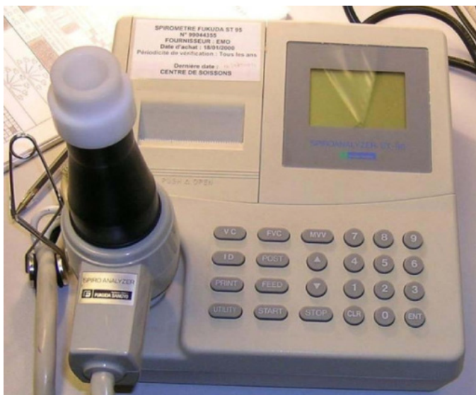
Example of an Electronic Spirometer

The difference in results between a physician's diagnosis of COPD as reported by the Veteran and COPD determined using spirometry may